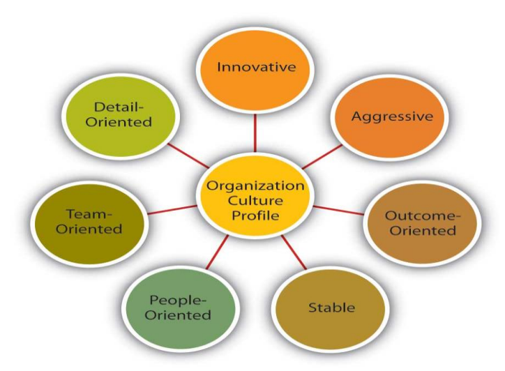
Figure 1: Organisational culture profile

Noble & Vaidyanathan (2022) stated that the adoption of Japanese business culture can play a crucial role in increasing the cultural development of Indian multinational corporations. Integration of foreign culture and managing social inclusion participate in this organisation. On the other hand, it is essential to state that the social cooperation of the organisation is also ensured potentially with the involvement of Japanese executives in the organisational needs and value of customers. The psychological implication of the organisation is also managed potentially with the involvement of Japanese executives. On the other hand, the stage of culture shock and the attitude of employees have also improved authentically with the involvement of Japanese executives and the Japanese management approach. Japanese management approach is conducted with the help of a three level of organisational culture, which is also fruitful for Indian MNCs.