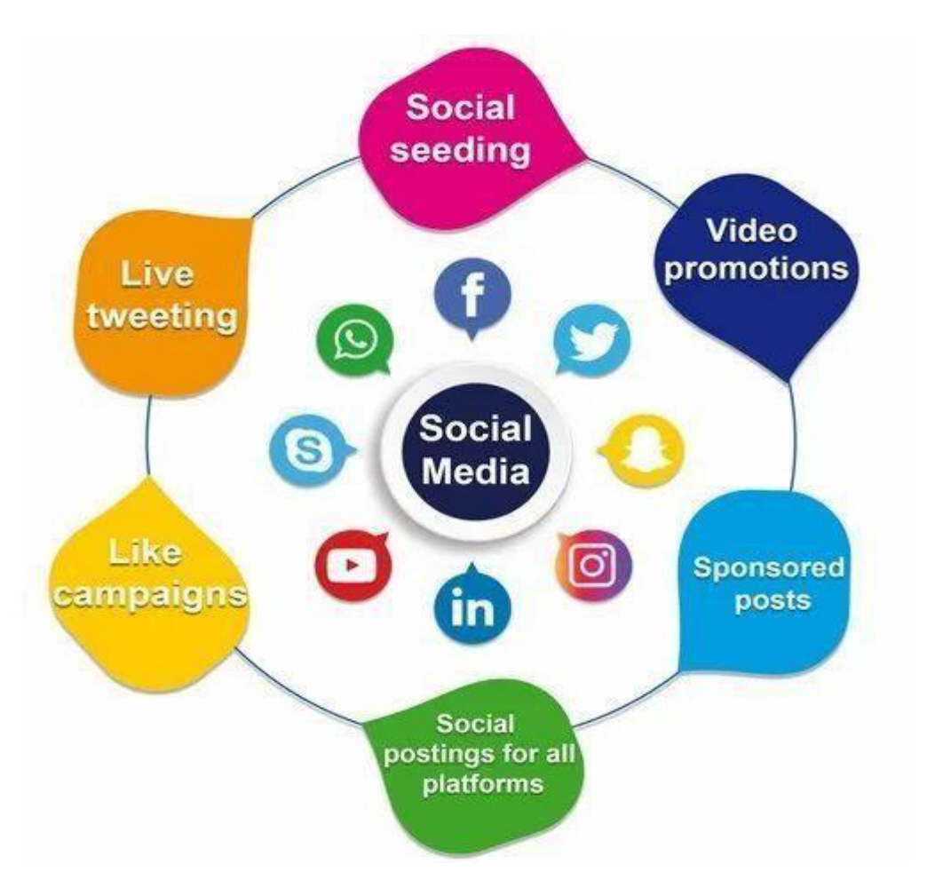
Fig. 1. These are the types of social media components and processes of advertisement

Facebook: It is one of the most used social media platforms for advertising digital marketing because it has approximately 2.8 billion users.