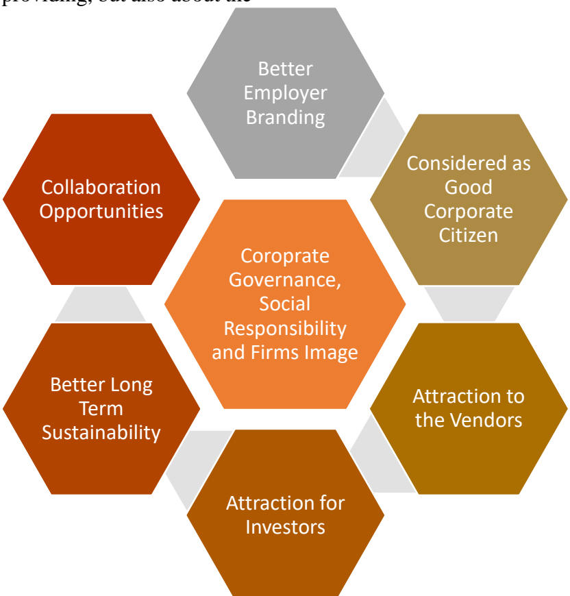
Figure 1 Benefits of Corporate Governance and Social Responsibility for Firms Brand Image