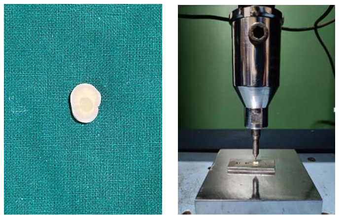
(Figure 2) showing horizontal disc of root for testing in the left image and Universal testing machine testing the bond strength in the right image.

\pi = 3.1416 , h = Thickness of the sample in mm, r=Radius.