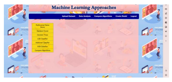
Fig: Decision Trees