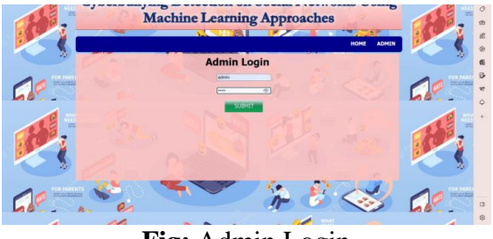
Fig: Admin Login