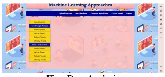
Fig: Data Analysis

various parameters of the outputs with the help of graphs, statistics etc.