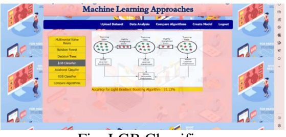
Fig: LGB Classifier

When the dataset is feed to Light Gradient Boosting algorithm we observe that the test accuracy is 93.13%.