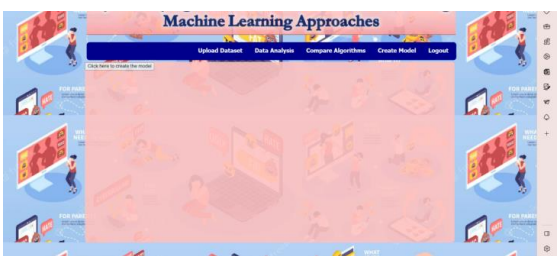
Fig: Create Model

This screen shows the Training Accuracy of the Model is 100% and Test Accuracy of the Model is 93.4%.