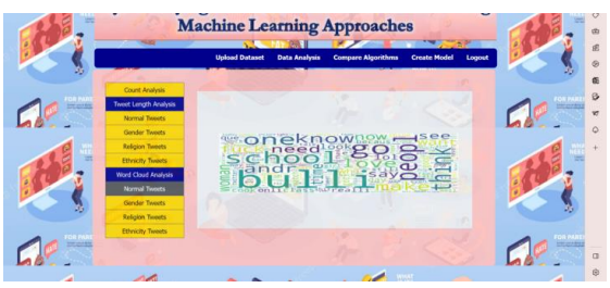
Fig Word Cloud Analysis of Normal Tweets

The below graph shows the Word Cloud Analysis of Normal Tweets over data present in the dataset.