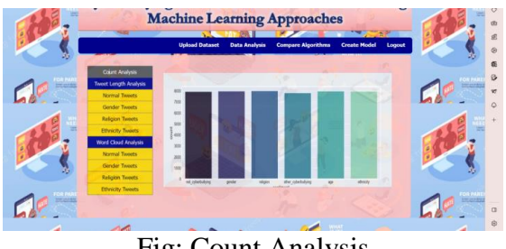
Fig: Count Analysis

The below graph shows the Count Analysis over data present in the dataset.