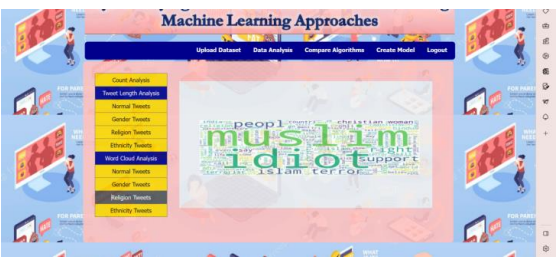
Fig: Word Cloud Analysis of Religion Tweets

When the dataset is feed to various algorithms for Word Cloud Analysis of Religion Tweets