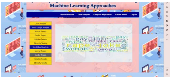
Fig: Word Cloud Analysis of Gender Tweets

When the dataset is feed to various algorithms for Word Cloud Analysis of Gender Tweets