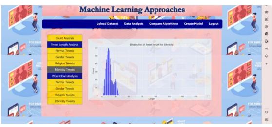
Fig Tweet Length analysis of Electricity Tweets

The below graph shows the Tweet Length analysis of Electricity Tweets over data present in the dataset.