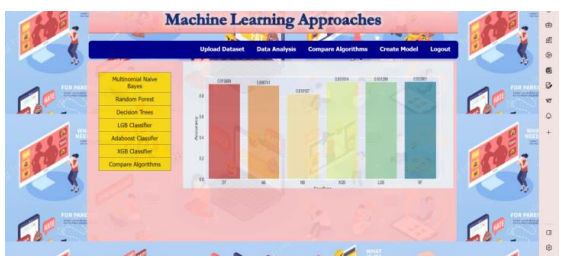
Fig: Compare Algorithm Summary

On this page, the admin can feed the dataset to various Algorithms to train them, get the test accuracy for each algorithm and their accuracies are summarized here.