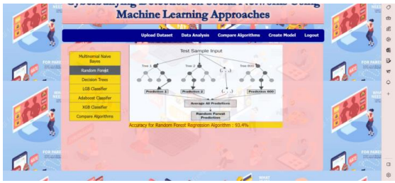
Fig: Random Forest

When the dataset is feed to Random Forest algorithm we observe that the test accuracy is 93.4%.