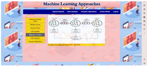
Fig: AdaBoost Classifier

When the dataset is feed to AdaBoost Classifier algorithm we observe that the test accuracy is 89.87%.