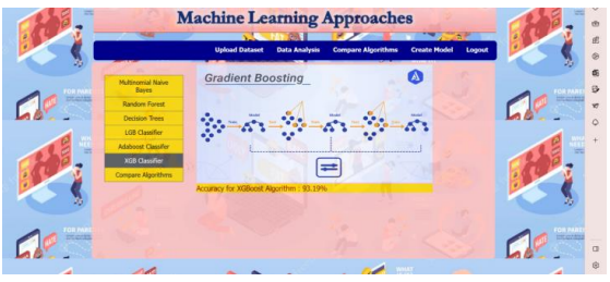
Fig: XGB Classifier