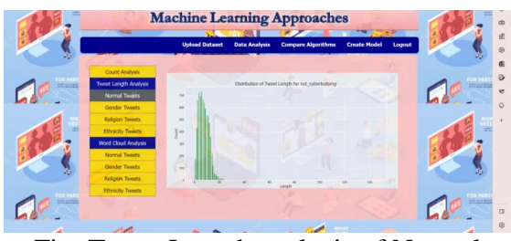
Fig: Tweet Length analysis of Normal Tweets

The below graph shows the Tweet Length analysis of Normal Tweets over data present in the dataset.