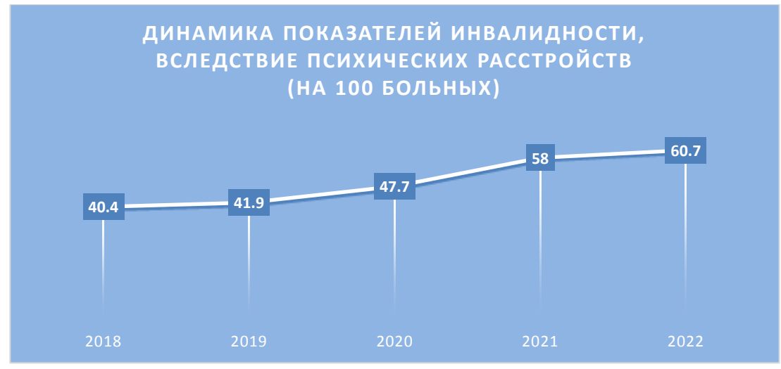
Figure 3: Trends in disability rates due to mental disorders from 2018 to 2022 in the Republic of Uzbekistan.

Regarding the level of disability resulting from mental disorders, the study findings indicate an upward trajectory. The disability rate per 100 diagnosed cases increased from 40.4 in 2018 to 60.7 in 2022. This trend is depicted in Figure 3.