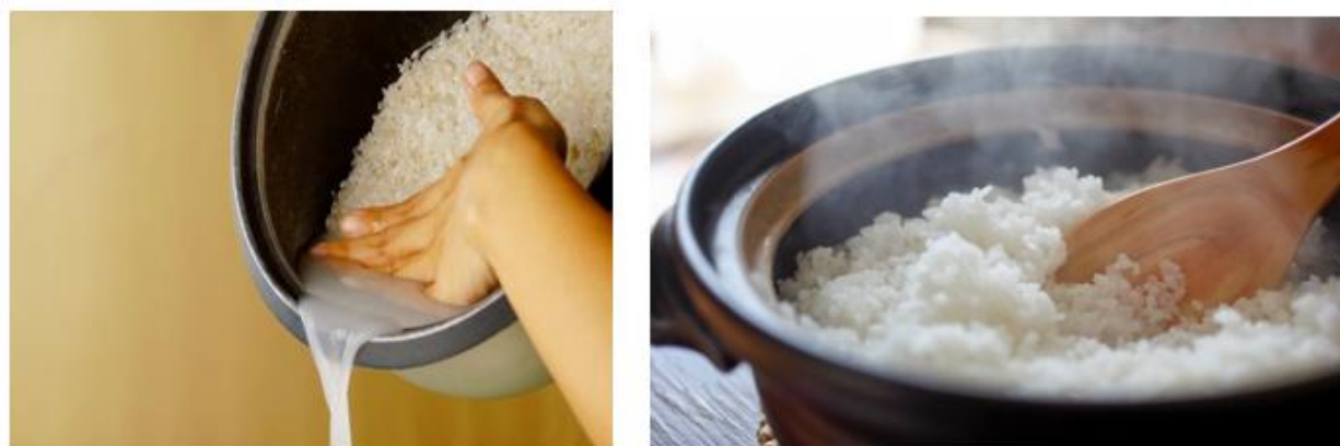
Figure 1. Process of cooking rice

The above surprise experience of the participant shows that they assumed the chemistry behind properly boiling rice while unaware of all the chemical interactions involved. Because chemical volatility is temperature dependent, some spices are put in a coarse form to control the release of chemicals. The more heat we apply, the quicker the chemicals come out. Some chemical bonds break in the presence of heat, spices, meat, and rice, whereas other chemical bonds keep the molecules together. When those ties are broken, the food becomes softer, which makes it easier to chew, give it a pleasant flavour, and digest.