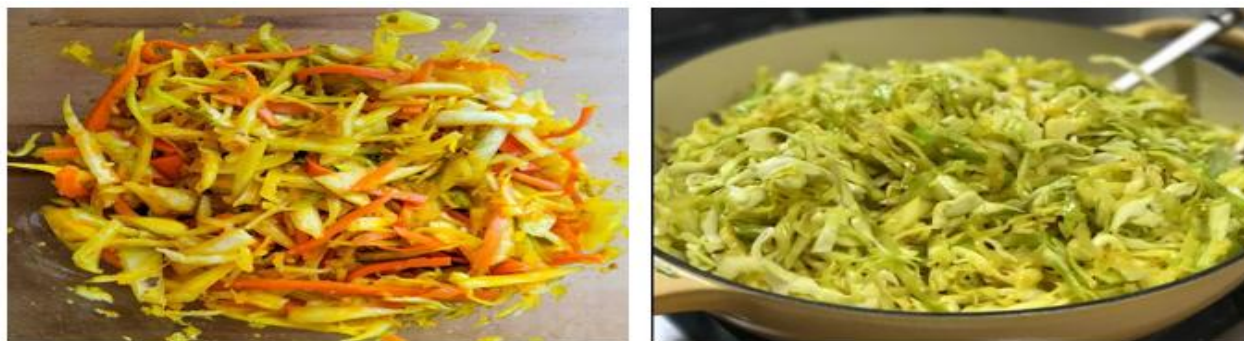
Figure 5. Adding salt before and after the turmeric when cooking vegetables