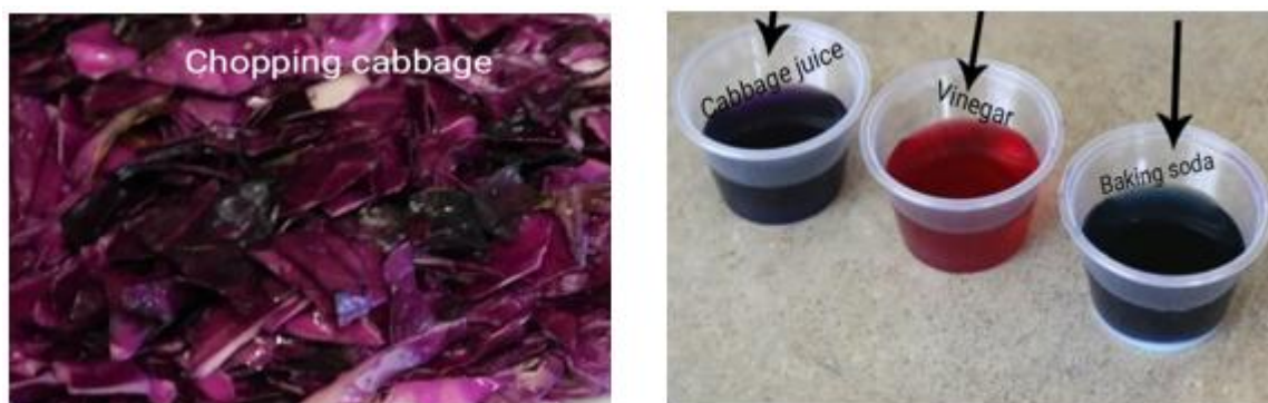
Figure3. pH testing experiment performed in the kitchen

Group B students performed a pH testing experiment in the kitchen using red cabbage juice as a natural indicator. To perform the pH test, students used materials like red cabbage, water, a strainer, a blender, a measuring cup, small bowls, lemon juice, baking soda, and vinegar. Students cut up red cabbage and blend it with two cups of water until it becomes a smooth crush. They strained the red cabbage squash through a strainer, collected the juice in a measuring cup, and poured a small amount of the red cabbage juice into a few small bowls. Added a few drops of the substance to the red cabbage juice and observed the colour change to test the pH of the substance. The red cabbage juice was turned pink, indicating the substance was acidic. The red cabbage juice turned blue or green indicates the substance is basic (Kuswandi et al., 2020). The pH of various kitchen substances like lemon juice, baking soda, and vinegar was tested, showing the different colours produced in the red cabbage juice. Red cabbage juice is a natural pH indicator that changes colour in response to acidic or basic substances. This experiment can be a fun and educational way to learn about pH and acidity in the kitchen. The pH testing experiment performed in the kitchen is given as follows: