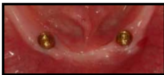
Figure 3: Locator abutments in Group 1 (Two-implant Group)

Suturing of the flap was done and removed after seven days. After three months, patients were recalled. Crestal incisions were made and cover screws were unthreaded. Locator abutments (KERATOR® Overdenture Attachment System) were tightened ( Figs. 3 and 4 ).