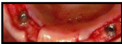
Figure 1: Two implants installed at canine regions (Group 1)