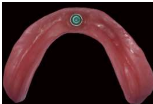
Figure 6: Fitting surface of overdenture in group 2 (One-implant group)

Participants were given strict oral hygiene instructions and recalled after two weeks, then one, two and three months to evaluate the soft tissue changes around each implant. The depth of peri-implant sulcus (probing depth) was measured, in millimeters, as the distance between marginal border of the peri-implant mucosa and the tip of the probe using a calibrated pressure-controlled plastic periodontal probe (Kerr, Rastatt, Germany) ( Fig.7 ). It was measured on the labial, mesial, distal, and lingual sites of each implant. Then the average of all sites was calculated for each implant. Bleeding on probing was assessed using the modified Bleeding on Probing Index ( Mombelli et al. 1987 ) as follows: score 0: no bleeding; score 1: bleeding on probing without redness and swelling; score 2: bleeding on probing, redness and swelling; score 3: spontaneous bleeding. It was assessed on the labial, mesial, distal, and lingual sites of each implant. Then the average of all sites was calculated for each implant.