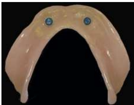
Figure 5: Fitting surface of overdenture in group 1 (Two-implant Group)