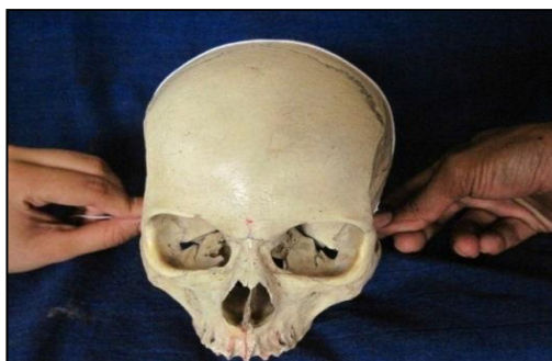
Figure 2 Maximum Cranial Breadths [Curved (bB)]

cranial breadth was recorded at the level of mid point of supramastoid crest.