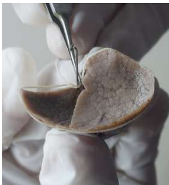
Fig No:03: - Basal circumference (measure by keeping thread around the border of inferior surface)