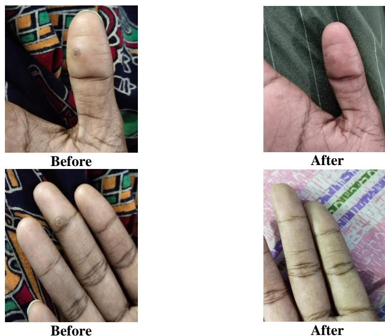
Fig 2: Before and After Treatment