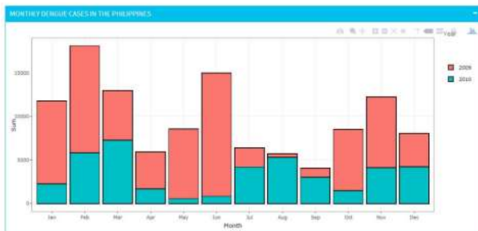
Figure 1. Dengue fever cases in the Philippines are displayed monthly in a bar graph.

Exploratory data analysis is always the first stage in data analysis. In its simplest form, this strategy uses a toolbox of methods to solve a wide range of problems, such as detecting outliers, identifying missing data, maximising insights within a dataset, discovering underlying linkages, etc. These methods—mostly quantitative but also graphical—let the data speak. Visualisations help data analysts convey their knowledge to non-experts. EDA was used to investigate potential correlations between our dataset's characteristics and variables. Scatter plots helped us understand how temperature and humidity affect dengue cases. This helps us understand dengue and weather. A bar graph (identical to Fig. 1) shows the Philippines' monthly dengue case counts for the past two years. This basic, handy stacked bar chart shows the monthly dengue case counts and the yearly sums. The top row provides yearly totals and the bottom row monthly case counts. Except for July, August, and September, 2009 had more dengue fever cases than 2010. This data forces us to review our three-month database. Please note that the monthly dengue cases for 2009-2010 are being used as an example to investigate if these variables are correlated. After gathering context for our dataset, we will move on to data purification. This topic is examined more below.