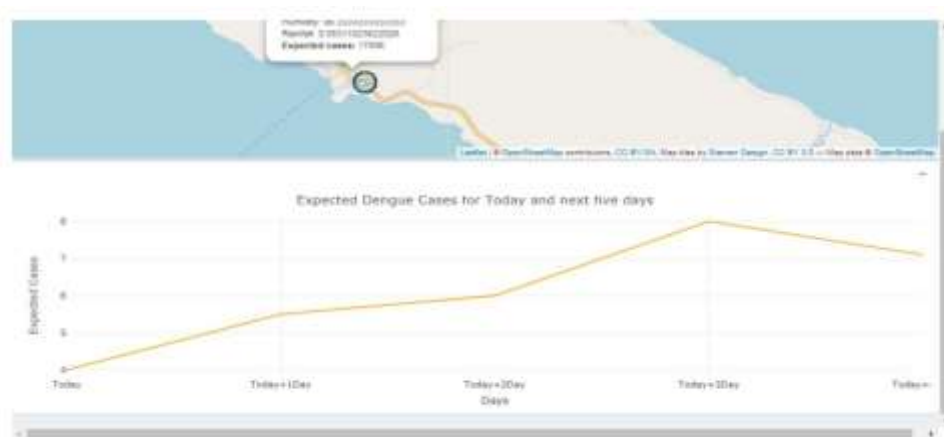
Figure 3: Live Demo model

Both the present weather in a city overlaid on a map and a forecast of dengue cases over the following five days are displayed in this real-world prototype. The prototype dashboard for the real-time model is shown in Figure 3.