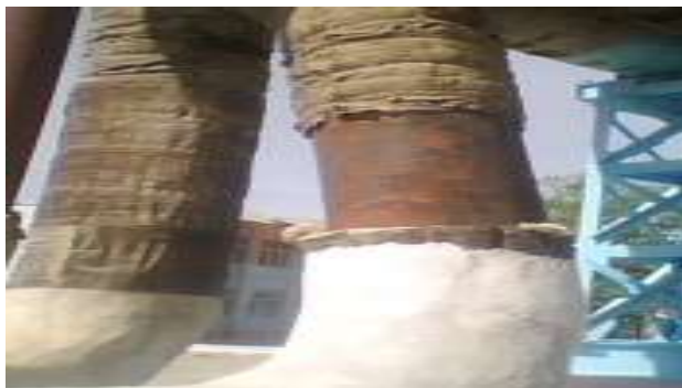
Fig. 1. Typical variants of corrosion during long-term use of basalt fiber materials for insulation.

The influence of salts on the quality, performance and durability of basalt heat-insulating materials was studied by monitoring the state of pipelines in the city of Navoi region, where basalt-fiber heat-insulating materials of various thicknesses produced by local enterprises were used. In this case, heat-insulating materials were used. Data and results of observation are given in table. 1.