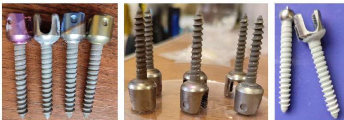
Figure 3. Titanium screws with calcium phosphate coatings obtained by three methods:

immersion deposition (a), micro-arc oxidation (b), and electrochemical deposition (c).