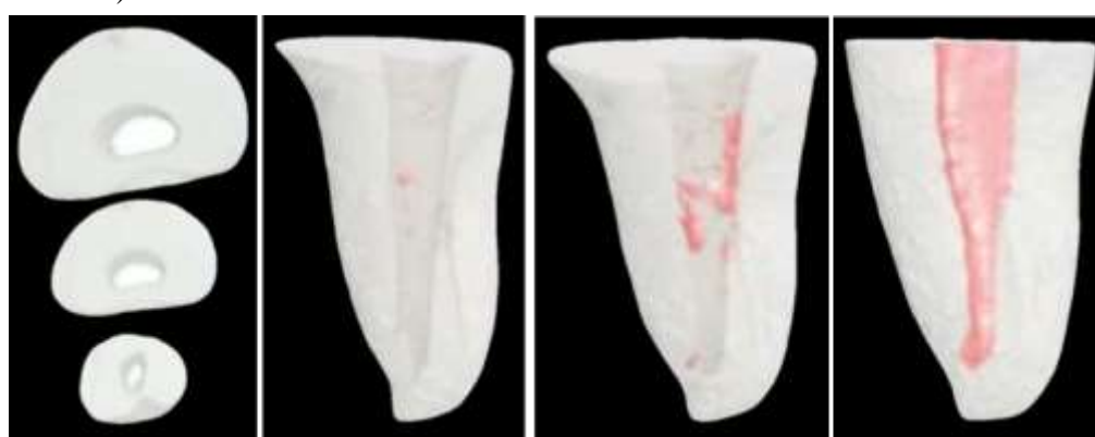
Figure (3): A Photograph of 3D volumetric of Micro CT in group 3 (XP-endo Finisher R.) post obturation, post filling material removal, post using XP-endo Finisher R , and cross section of the root (from right to left).