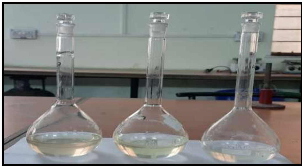
F1 F2 F3