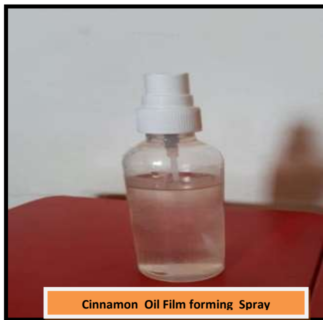
Figure 5: Topical film forming spray