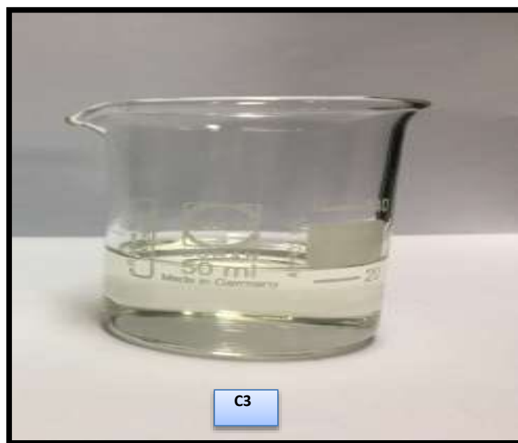
Figure 4: Cinnamon oil film forming spray formulation