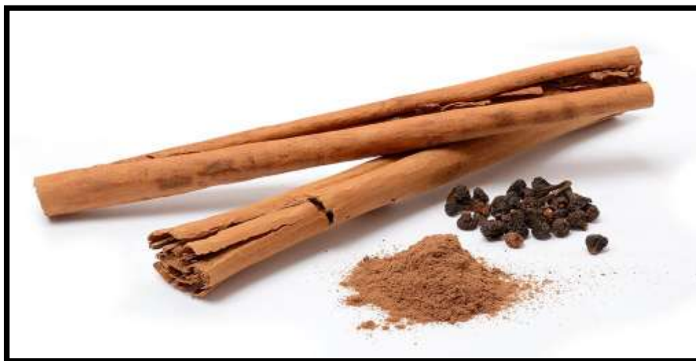
Figure1. Barks and dried flowers of Cinnamomum zeylanicum

Cinnamomum zeylanicum Blume, a member of the family Lauraceae, is a tropical evergreen tree, native to Sri Lanka and the Malabar Coast of India, Medicinally, cinnamon is used in the treatment of diarrhea, flatulent dyspepsia, poor appetite, low vitality, kidney weakness and rheumatism, influenza, cough, bronchitis, fever, arthritic angina, palpitations, hypertension and nervous disorders, stimulating the circulatory system and capillary circulation, spasms, vomiting and controlling infections, reducing blood sugar levels in diabetics and as a skin antiseptic. Cinnamon is rich in essential oils and tannins which inhibit microbial growth. The most important chemical constituents of cinnamon are volatile oil (cinnamaldehyde, eugenol, cinnamic acid and weitherhin), mucilage, diterpenes and proanthocyanidins. 1,16,17