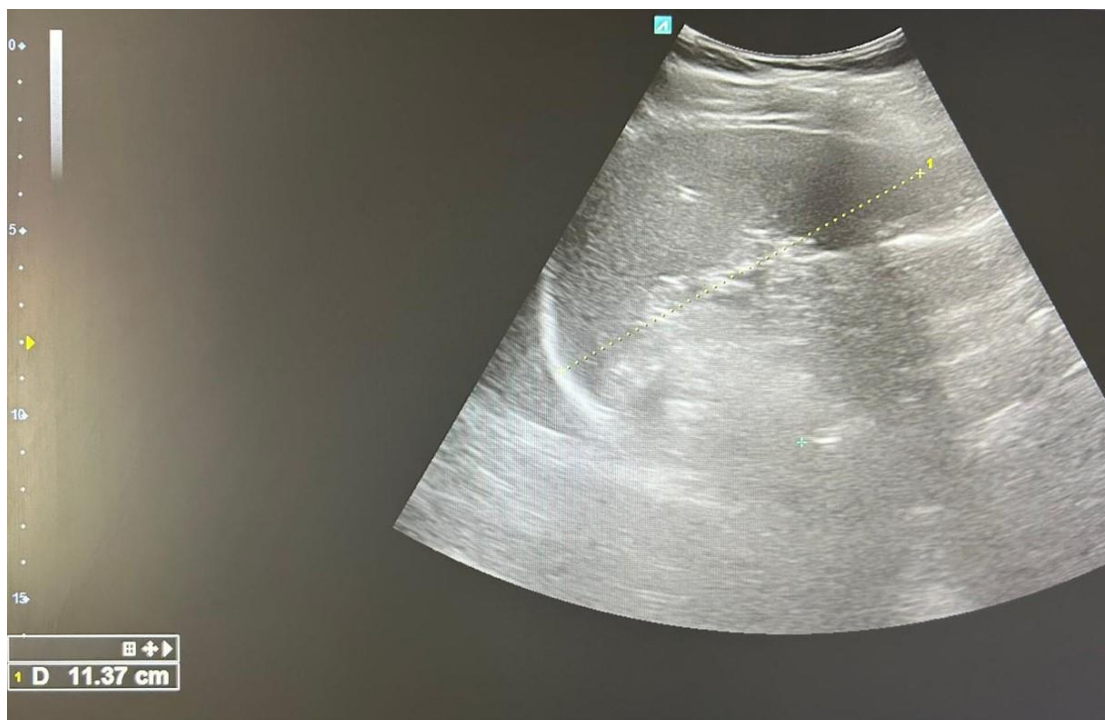
Measurement of length of spleen