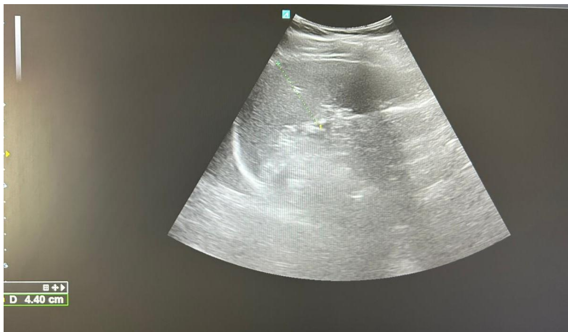
Measurement of width of spleen