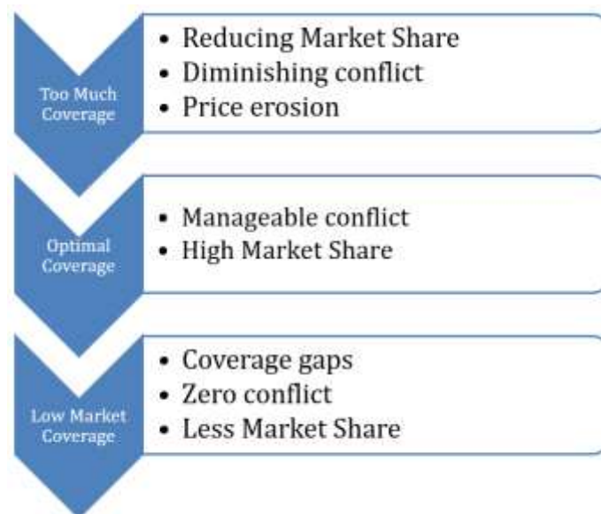
Figure 2 – Market Coverage and Conflict

Finally, the bottom segment suggests low market exposure for the business due to too limited distribution channels. From both direct sales and distribution, aggregate sales will have less overall market share.