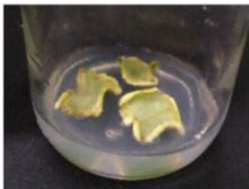
Figure 1. Callus induction at second weeks

lengthen and widen. It was also a swollen wound cover that was beginning callus induction (Figure 1). The callus color in this abiotic elicitor treatment was generally yellow-brown and green-brown with a compact callus texture (Figure 2).