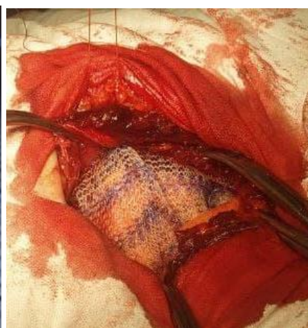
Fig. 3. Fixation of the “sublay” endoprosthesis to the anterior abdominal wall with previously applied U-shaped sutures

The use of composite mesh implants "Physiomesch" or "Prosid" (Ethicon) in 12 (26.7%) patients avoided the need to create a preperitoneal "pocket" before fixing the prosthesis to the anterior abdominal wall.