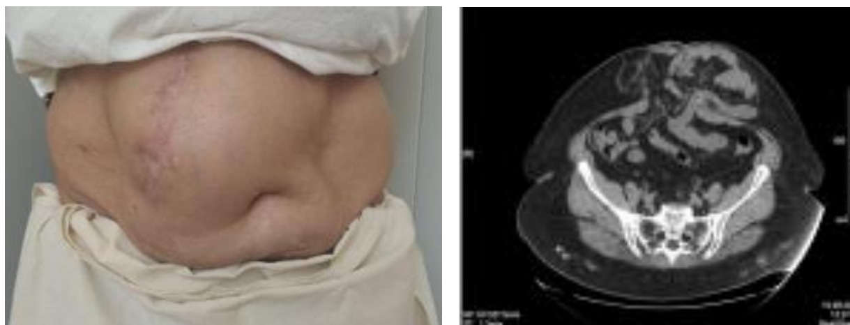
Fig. 1. Patient P., 56 years old with postoperative ventral hernia (M 2 W 3 R 0 ) and computed tomography of the anterior abdominal wall and abdominal cavity

Computed tomography was performed in 69 (42.9%) patients of the main group and was performed to determine the size of the hernial orifice, the volume of the contents of the hernial sac, identify additional defects in the aponeurosis, identify concomitant pathology of the abdominal organs and topographic changes due to adhesions, thickness and uniformity subcutaneous fat of the anterior abdominal wall, as well as for the preliminary determination of the method of hernioplasty (Fig. 1).