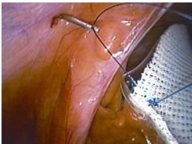
Fig. 2. Removal of the suture thread with a modified Endo Close needle (view from the side of the abdominal cavity)