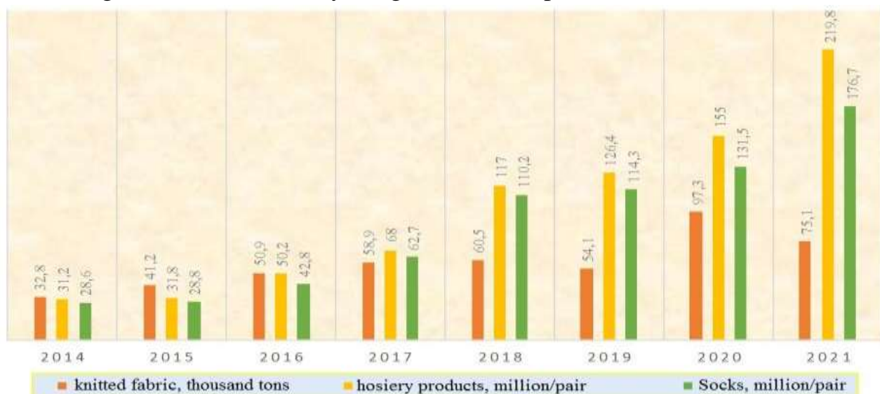
Figure 2. Production of knitted fabric, hosiery-socks, socks in Uzbekistan.