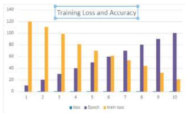
Fig. 3 Training Loss and Accuracy graph for ASL

The model training was carried out by Adam developer with SoftMax loss function. Epoch was set to the maximum range of 100 & training ratio was put at 0.003. During of training loss and accuracy plot are represented in Fig. 3. The chart represents the little loss through limited overflowing after that 100 epochs.