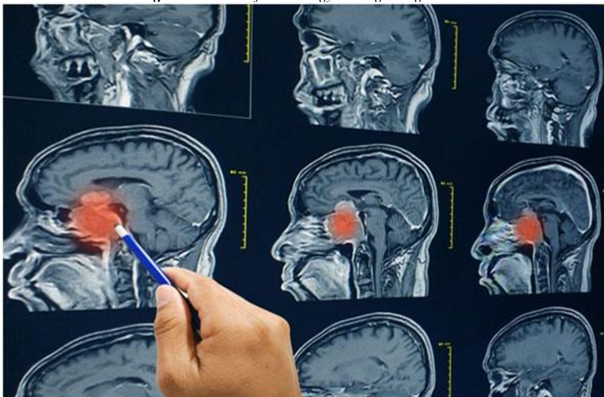
Figure: The Role of Technology in Diagnosing Disease

The Role of Technology in Diagnosing Disease(Mathesul et.,al 2023).