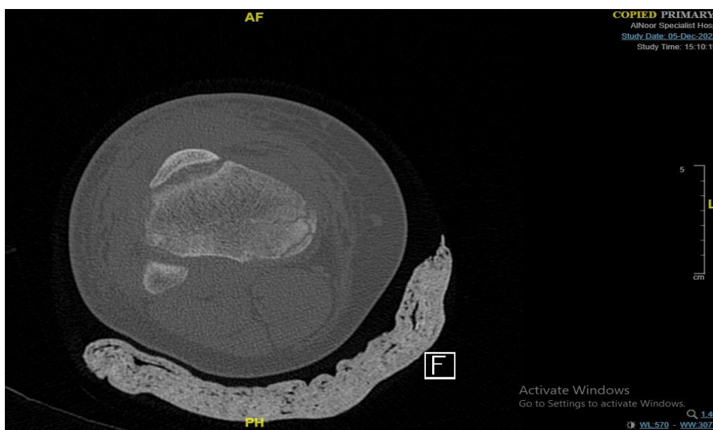
Figure (2): CT scan reveal transverse tibial fracture line with widening prominent anteriorly and laterally with oblique extension. No intra-articular extension.