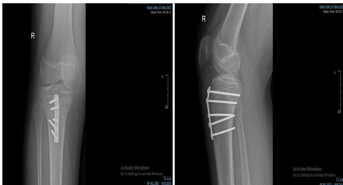
Figure (5): AP and lateral view at 3 months follow up visit.