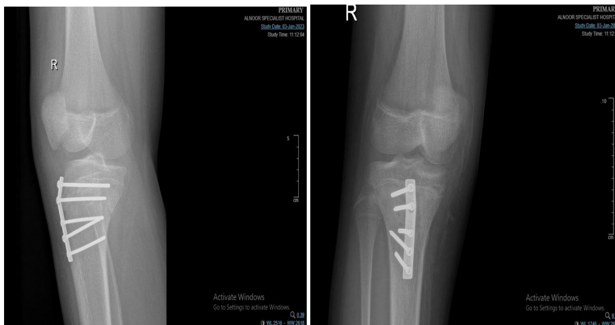
Figure (4): AP and lateral view at 3 weeks follow up visit.

So the outcome from our patient showed that fixation with screws and plate is safe with an excellent functional result and has a similar outcome compared to fixation by screws.