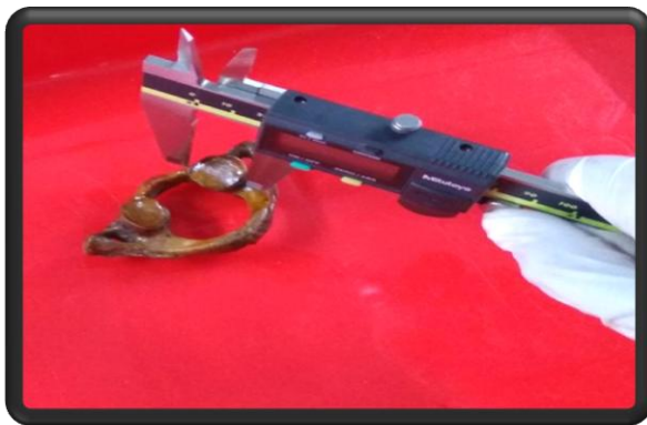
Figure 3: AP diameter of inferior articular facet of atlas