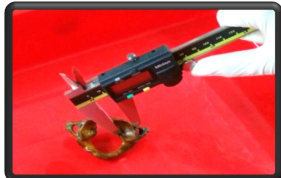
Figure 2: Transverse diameter of superior articular facet of atlas