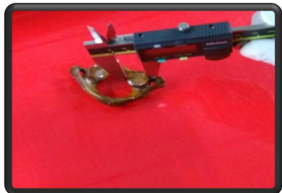
Figure 4: Transverse diameter of inferior articular facet of atlas