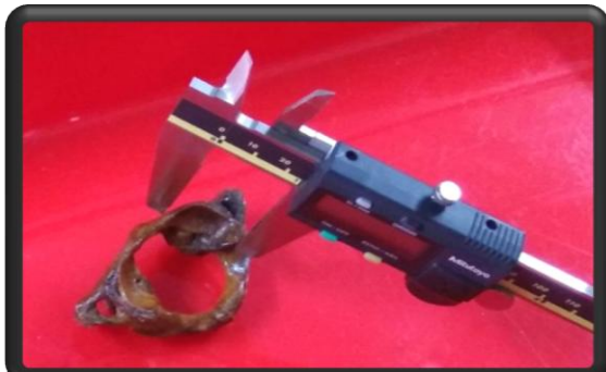
Figure 1: AP diameter of superior articular facet of atlas