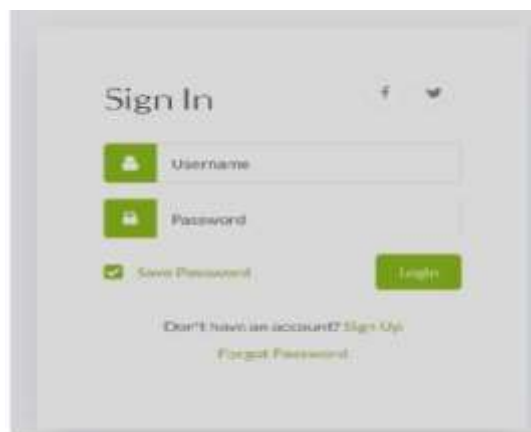
Fig 4. Expert team module

Expert Team Module: The facts, details and precise knowledge of the updated prices, market value understanding will be provided in this modules as they were analyzed by experts. This module benefits the local farmers in understanding the genuine prices of their products in the markets and this will also avoids their undue exploitation by the middle men or mandi dealers [29][30].