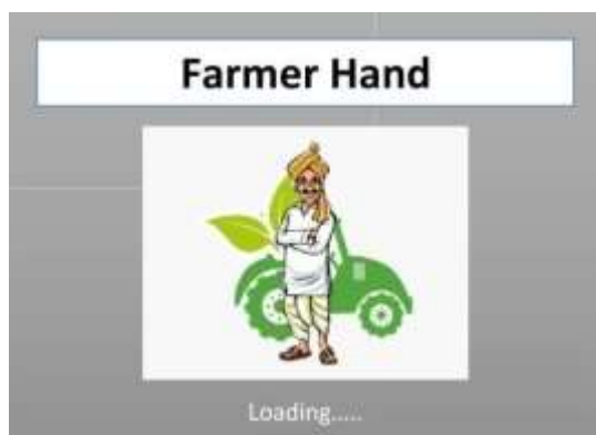
Fig 2. Main Page

Main Page: The default or first page of the database is based on proposed study title i.e., “Farmer Buddy”. This will be easily recognized by the agronomists that they are accessing a farmer based application [25][26].