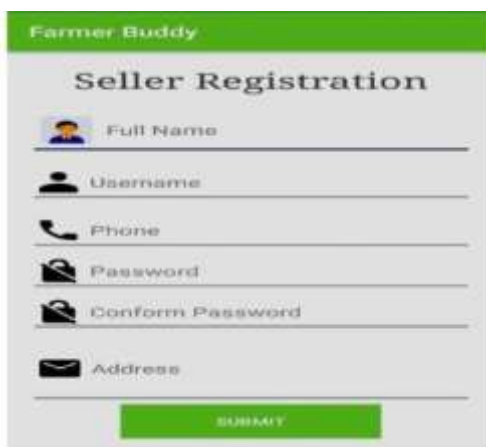
Fig 3. Registration Page

Registration Module: This is the registration portal for all the first users. The registration is mandatory in order to access the Farmer Buddy application. After the successful registration, the login ID and password will be generated this is used for using the application [27][28].