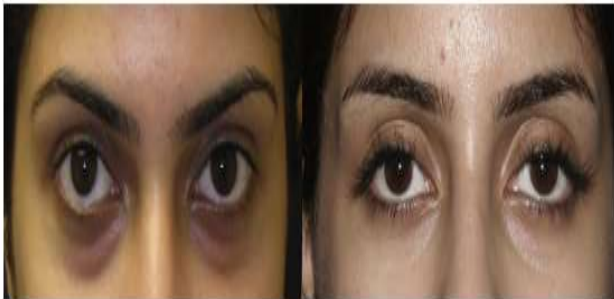
Fig. 2 Improvement of laser techniques (43).

Laser technique is most effective therapy for removing of dim colour under the eye skin dark circle. The various factors of dark circles are excessive melanin secretion, ridge, and fine lines these all problem can be treated by using laser technique. The most physician prefer this technique of removing dark circles. There are different types of laser therapy are available for peri orbital are Q switched laser, fractional laser, radiofrequency devices, and pulse-dye lasers. There are multiple Q switched lasers available for removal dark circles (43).