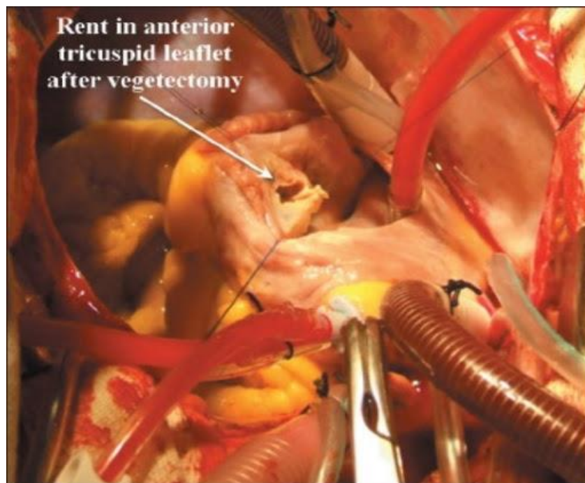
Figure (3): Vegetectomy