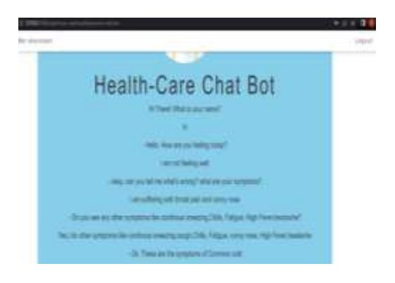
Fig 2: Healthcare Chatbot Result Page – 1