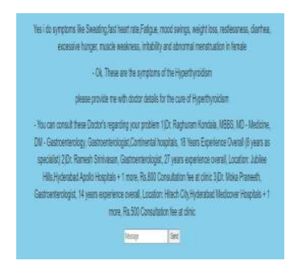
Fig 4: Healthcare Chatbot Result Page – 3