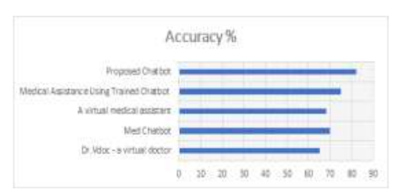
Fig 5: Comparison of Accuracy of Medical Chatbots

Table 2, have been plotted in the graph for visual analysis.