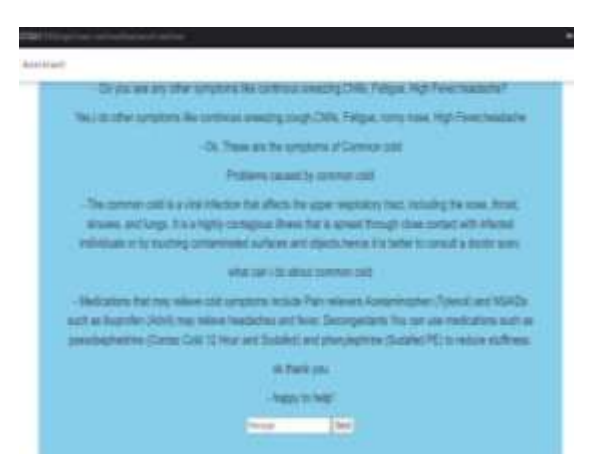
Fig 3: Healthcare Chatbot Result Page – 2