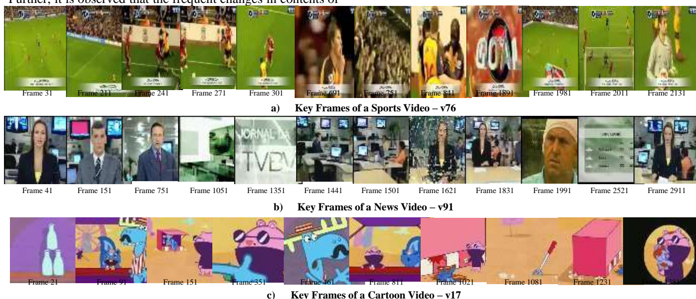
Figure 2. Extracted Key Frames for the Web Dataset

news, commercial, and tv-shows videos with the accuracy of 92%, 94%, and 93% respectively. The performance measure of this technique outweighs other techniques against news and tv-shows videos even in the presence of redundant events. Further, it is observed that the frequent changes in contents of