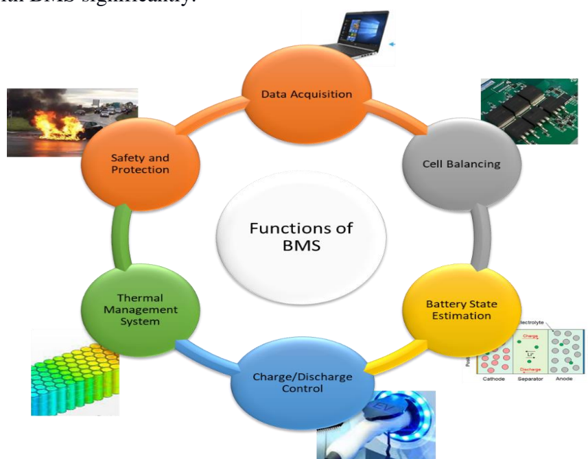
Fig 1. Functions of the battery management system

BMS is an electronic system that serves as the brain of the battery system. As shown in Fig 1, some of the key functions of BMS are charge and discharge control, thermal management system, cell monitoring, and balancing, fault diagnosis and health management, data acquisition, and modeling and state monitoring. The economic advantages of BMS are extensions of battery lifetime and lowering the cost. For example, BMS shares only 8% of the total battery pack cost for a 22 kWh mid-size EV battery pack. Standardization of BMS for EVs and proper implementation of the standards in EVs can reduce risks and hazards associated with BMS significantly.