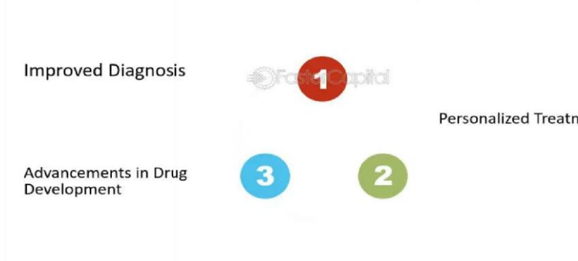
Figure: PPIPLA and Medical Imaging: Advancements in Diagnostics and Treatment How PPIPLA is Revolutionizing Diagnostics

Advanced advancements have changed the nature of treatment and pharmaceuticals. Propels in non-invasive advances such as MRI and CT channels empower early and more precise conclusions. Besides, the AI-powered introduction gadget is modern in analyzing therapeutic pictures and special plans portraying diverse conditions. Utilizing machine learning, these devices can help experts make more educated treatment choices and eventually achieve way better outcomes (In-Mohammed et. al 2021).