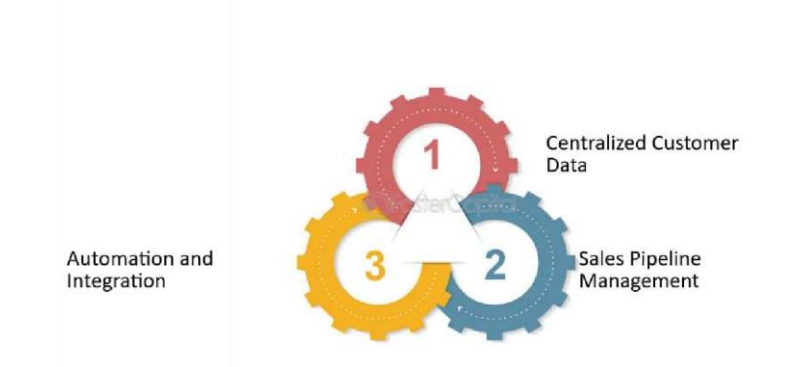
Figure: Leveraging Technology to Increase Opportunity Volume Maximizing Opportunity Potential

these challenges and utilizing innovation, healthcare suppliers can progress in well-being, patient results, and eventually move forward in care.