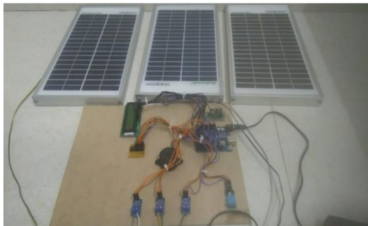
Figure 2 Hardware diagram

Solar panels are used in photovoltaic (PV) power systems to gather energy from the sun. A PV panel is a solar cell assembly that has been packaged. Solar panels, a Maximum Peak Power Tracking (MPPT) controller, an inverter system, and batteries are all common components of a photovoltaic power system. It is vital to choose the right solar panel and battery for the PV power system to work efficiently.