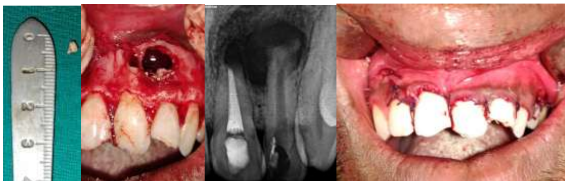
Figure 3d: Apicectomy of 21 and retrograde filling with biodentin