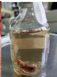
Figure 3c: Enucleation of cyst