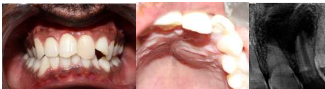
Figure 1a: Pre-operative picture