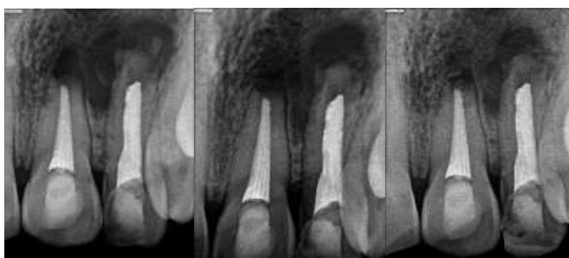
Figure 4a: Immediate post operative