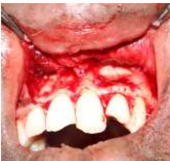
Figure 3a: Flap reflection