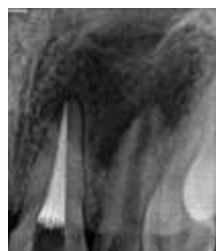
Figure 2b: Obturation with 21