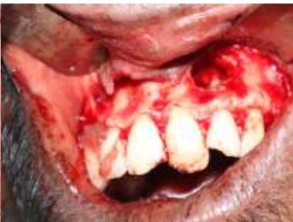
Figure 3b: Osseous window was created to access the cyst