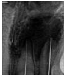
figure 2a: Working length determination