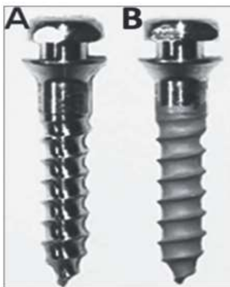
Figure 2: A) Machined surface. B) After Anodic Oxidation

Osteoblasts are better attached to rough surfaces which creates better bone formation around the screw surface, thereby ensuring greater stability. Quantity of calcium and phosphorous on the surface were higher in anodized implants. The presence of different porosities aids in potential drug incorporation and release around these implant surfaces. Choi S H et al conducted a study on the structural stability of anodized mini-screws and he could find that the surface characteristics are improved when compared with machined surfaces, even if little alteration of surface characteristics by self-drilling procedure is present. 10,11