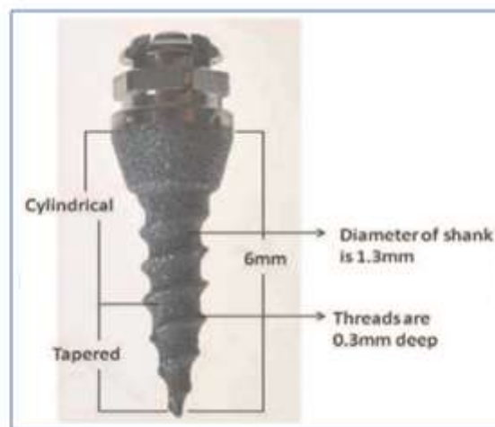
Figure 3: Implant Surface with large grits, sandblasting and acid etching

Sandblasting, Large grit, Acid Etching (SLA): Sandblasting is one of the earliest techniques in order to increase surface characteristics. It is a technique by which Alumina (Al 2 O 3 ) particles are blasted onto the implant surface, followed by acidic solution treatment. The size of alumina particles varies from 250-500 µm and solutions like hydrochloric acid, Nitric acid, and sulfuric acid are commonly used for the acidic solution treatment. This technique makes the implant surface rough enough to enhance the stability in bone. The technique of using large grit alumina particles for sandblasting, followed by acidic solution treatment and is known as SLA method 8