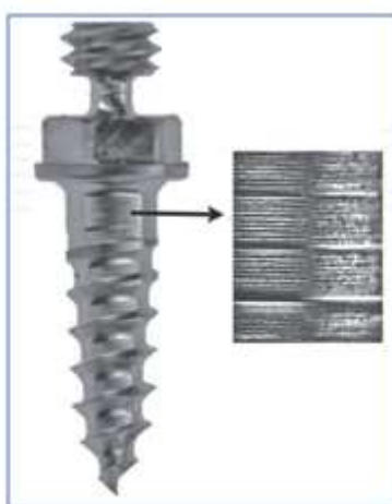
Figure 4: Micro- grooving on implant surface

Micro-grooving: This is one of the easiest ways of surface modification. It involved making microgrooves on implant surface, which improved the cutting capacity and biomechanical properties. (Figure 4) 10